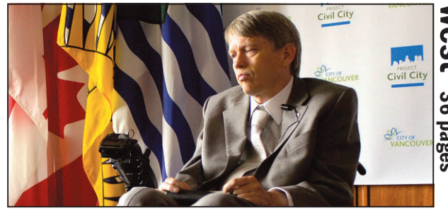
Sullivan faces his final months page 9